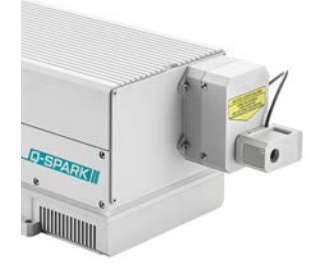
Attenuator and pulse energy monitor attached to the laser head